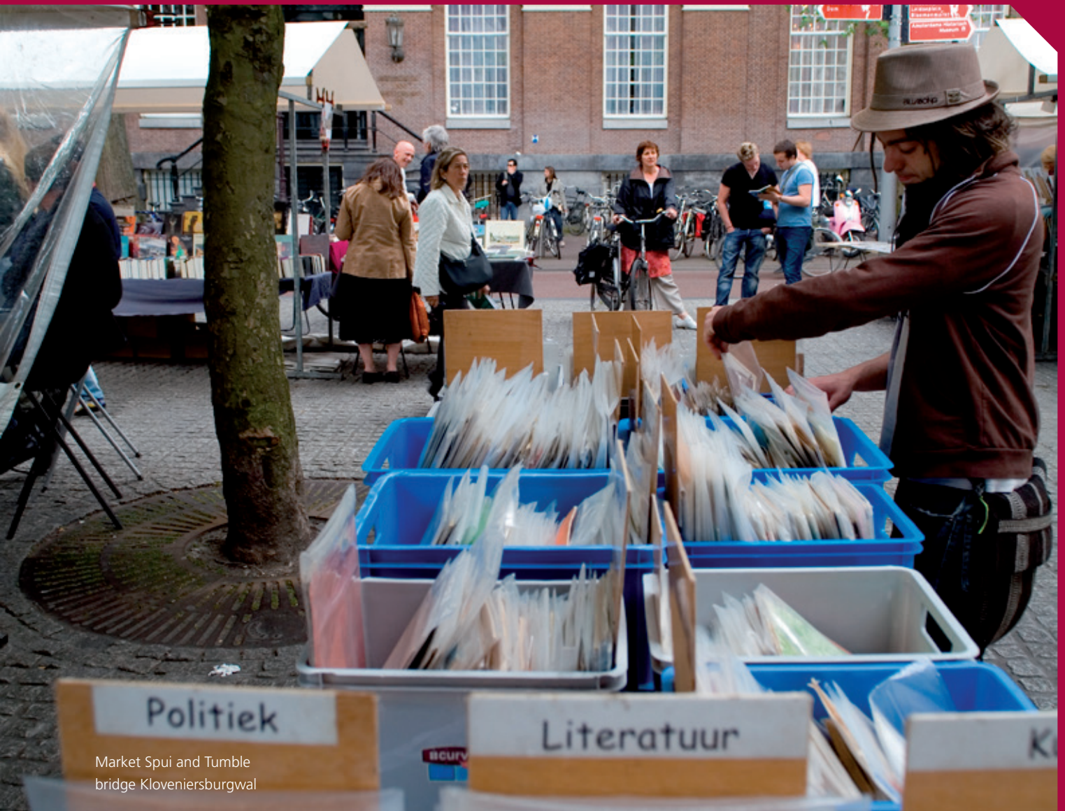
Market Spui and Tumble bridge Kloveniersburgwal