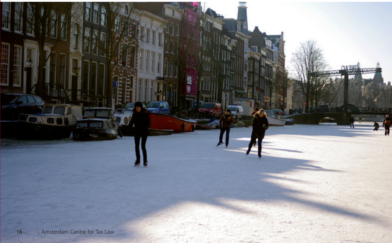
Amsterdam in winter time

The faculty building has had many functions over the centuries. It was originally built in 1601 as a retirement home for old men ('oude mannen' in Dutch) and was financed with earnings from an Amsterdam lottery. After some remodeling the building became the Academy of the Visual Arts in 1837 and the museum of banker and art collector Adriaan van der Hoop in 1854. Since 1880 it has been the main building of the University of Amsterdam.